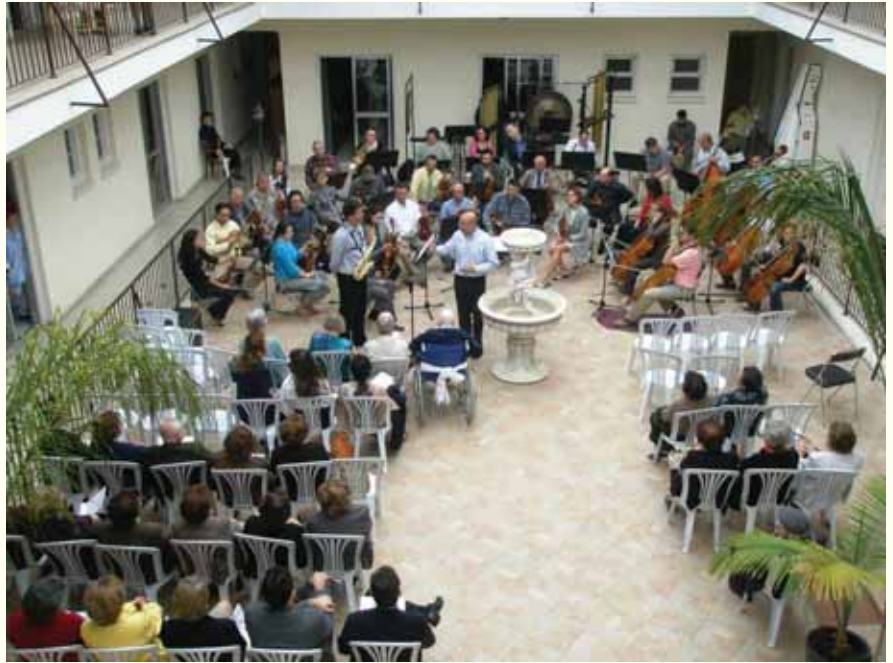
The Cyprus Symphony Orchestra performing at the Rest Home

The primary aim of the Rest Home is to provide a clean and safe environment for its residents and to give them dignified care and treatment. In addition, the management team does its utmost to organize various events in order to provide entertainment and relaxation for the residents. These include classical music concerts and the distribution of fresh reading material.