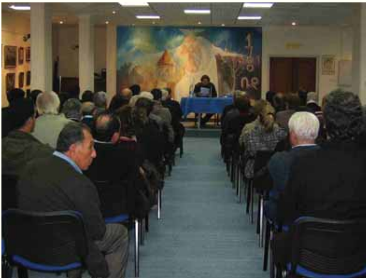
The book’s author addressing the audience