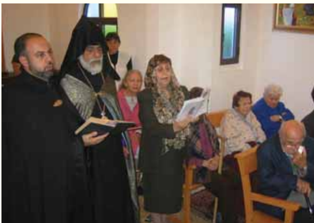
Christmas service at the Sourp Amenaprkich Chapel, conducted by Archbishop Varoujan and Der Momik