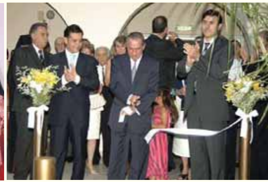
The inauguration of the Rafaelian Wing of the Kalaydjian Rest Home in June 2006