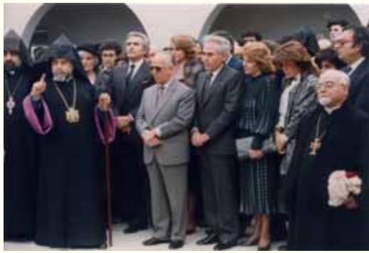
The official opening of the Kalaydjian Rest Home in March 1988