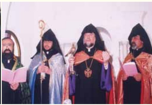
The consecration of the Sourp Amenaprkich Chapel in February 1997