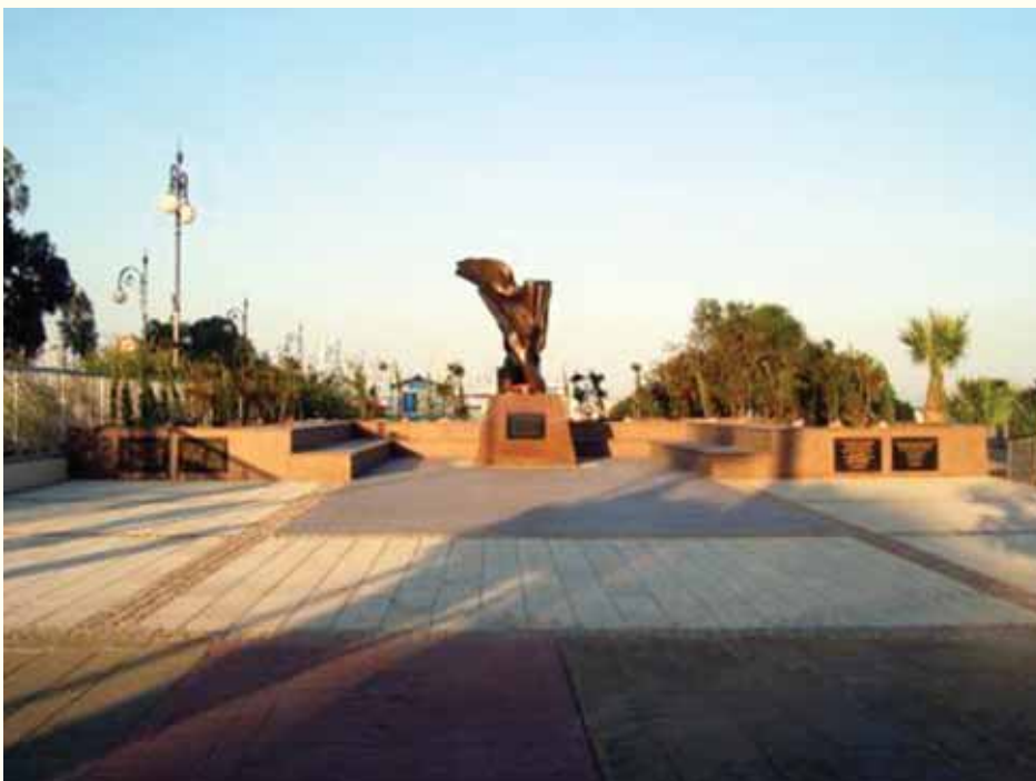
The Memorial Square in front of the Armenian Genocide Monument

The Armenian Genocide Monument was officially inaugurated by the President of the Republic of Cyprus Mr. Demetris Christofias on the 28th of May 2008.